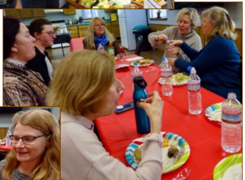
(Top) Delectable spread of food from Mad City Chefs. (Bottom three photos) Members filling their plates. No calories at this event!