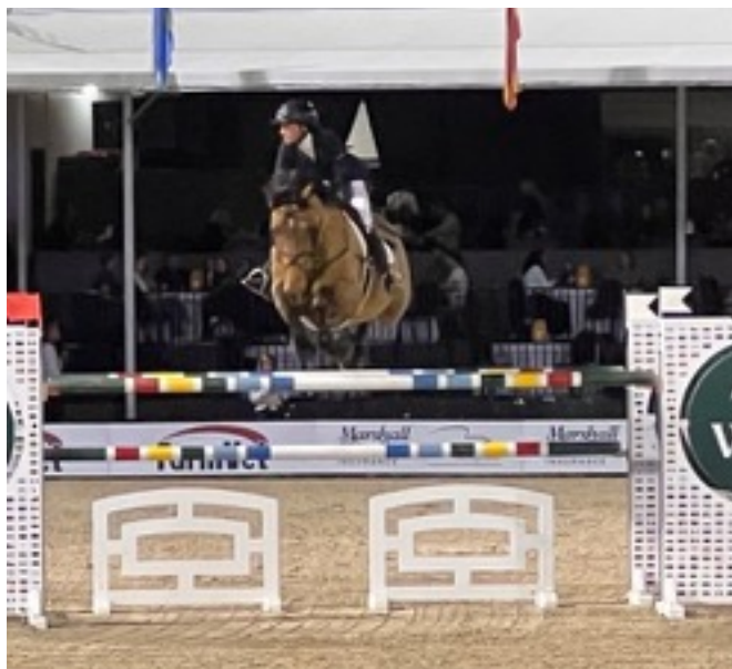
At Wellington International, I watched horses with invisible wings. This was lucky timing in a photo shot.

While in Wellington, I enjoy going to the jumper show grounds, and it's why my friends and I also bought jumper tickets for the World Cup this April in Omaha. I admire the athleticism and courage of the riders and horses.